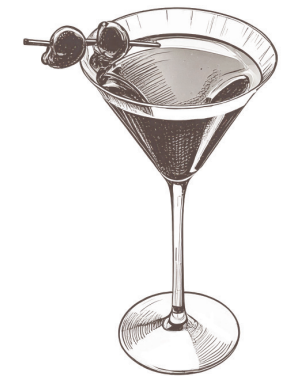
ESPRESSO MARTINI 65